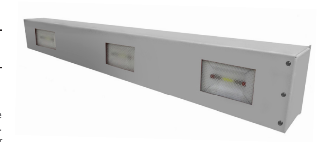
VRL Series Vandal Resistant Linear Light

Applications include: Public Parks, Public Restrooms, Rest Stops, Transit Station, Pedestrian Tunnels & Walkways